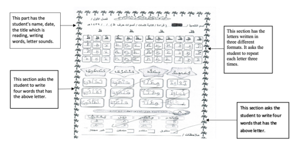
Figure 1: Example of Student Work

This participant provided a sample of a student work (Figure 1). For this assignment, students were required to correctly copy letters and words. The sample student copied letters and words correctly without any mistake. The student was able to write all letters and words correctly. So, the student grade was excellent on this worksheet.